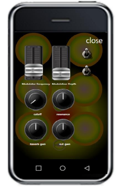
Figure 2. Sound control box screen.

The sound control box is sound setting and sound data control window. Basically, the web has build Frequency Modulation Synthesizer that main sound timbre harmony fingering pitch, modulator frequency and depth value. Also subtractive synthesis is similar filter effects. We can control "cutoff" and "resonance" value. For smooth sound, we have set stereo reverb. Figure 2 shows slide and dial of data parameter in sound control box.