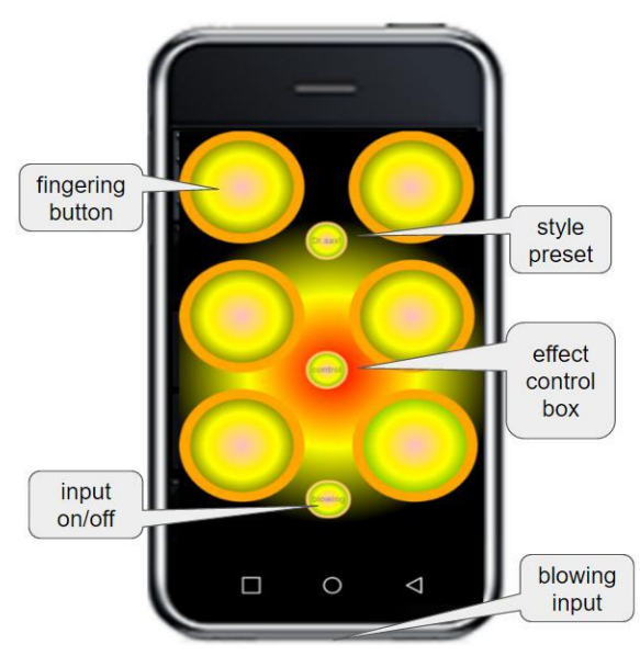
Figure 1. Functions of button.

Figure 1. shows a six fingering button and tree control but-ton with each role in the mobile phone.